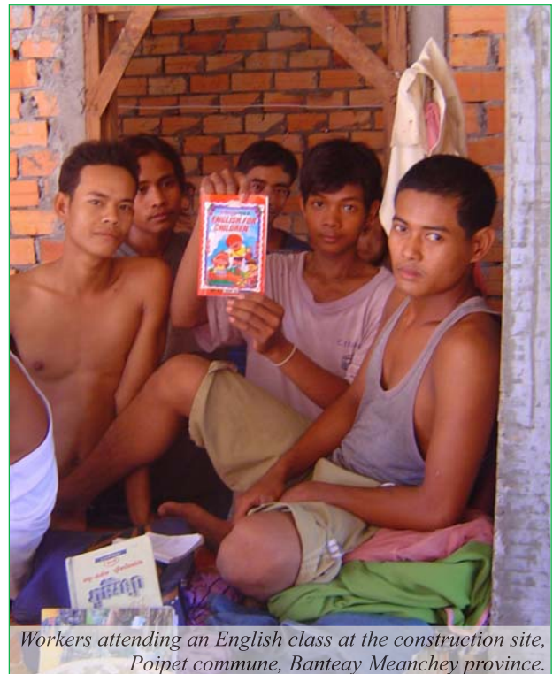
Workers attending an English class at the construction site, Poipet commune, Banteay Meanchey province.

Previous studies have suggested that internal migration can have both negative and positive impacts on development and poverty reduction. Even though its net impact is still open to debate, internal migration can be a crucial livelihood strategy for many poor people and an important contributor to national economic growth (DFID 2004). This argument is supported by Laczko (2005). He points out that internal migration has the potential to contribute to development in a number of ways. By supplementing their earnings through off-farm labour in urban areas, rural households diversify their sources of income and accumulate capital. In the short term, migration may result in the loss of local financial and human capital, but it can also contribute to the long-term development of rural