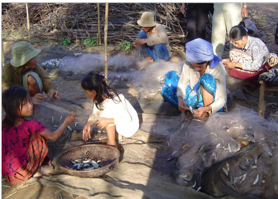
Fishing is an income source for rural people. Income is a CBPMS indicator for monitoring poverty.

A total of 11,937 households in six communes of Battambang and Kratie provinces were surveyed from October 2003 to November 2004. These households represented two districts of contrasting socio-economic conditions. For a census at the commune level, knowledgeable villagers were recruited and trained to undertake the household interviews based on a five-page questionnaire. Data were processed manually under the management of the commune councils and under the technical supervision of the project supervisory team. As a result, the six communes were able to produce their own books of poverty statistics for planning and monitoring. The study examined the different CBPMS indicators reflecting the multidimensional nature of poverty: demography, education, housing and land, health, income and expenditure, assets, violence and security and order. However in this paper, we report mainly on the