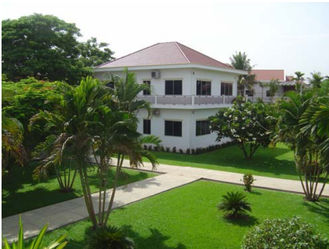
CDRI's new building at Tuol Kork, Phnom Penh.