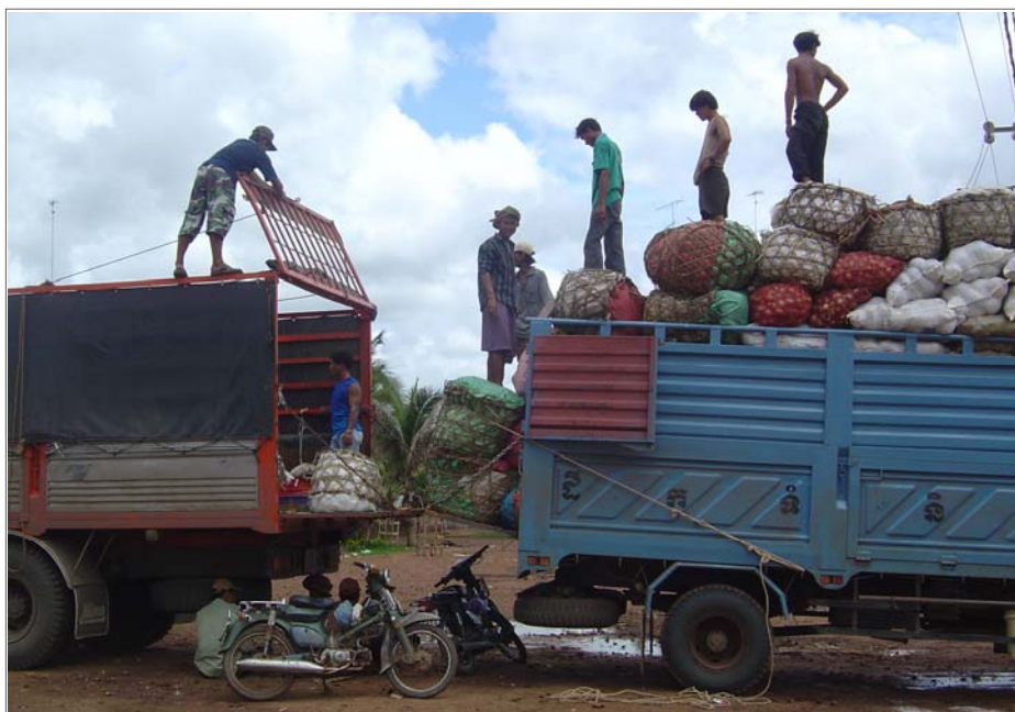
Cargo transshipping into Cambodia at a checkpoint on the Cambodia-Vietnam border.

but still has a long way to go. The region is close to China—a fact that is viewed with interest and some trepidation. The sub-region is also close to major economies like Malaysia and Indonesia, which expect very large gains from economic cooperation through broadening and deepening of markets, transfer of skills, ideas and technology and FDI flows. The CLTV countries are committed to regionalism and globalisation, and are keenly aware of the need to construct efficient, competitive market economies on the basis of their dynamic comparative advantages.