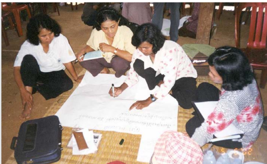
Commune Council members in Samlot district, Battambang province, in CDRI training seminar on Conflict Management, 05 June 2002.

The recently launched decentralisation reform has explicit poverty alleviation ambitions. Its objectives are defined by the Royal Government of Cambodia (RGC) as: (i) promotion of pluralist participatory democracy at the local level, (ii) promotion of the culture and practice of participatory development at the local level, and (iii) contribution to reduction of poverty in the country. 1 Great hopes have been pinned by both the government and the donors on its ability to meet these objectives. Globally, however, there is no empirical evidence suggesting there is a clear connection between decentralisation and poverty reduction. 2 Rather, lessons learned from other countries show that decentralisation programmes thus far have generally had little impact on